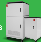
Hydrogen Fuel Cell Hydrogen Generator