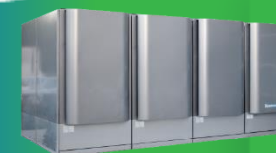
SOFC key components