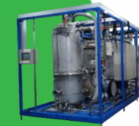
Waste Hydrogen Treatment System